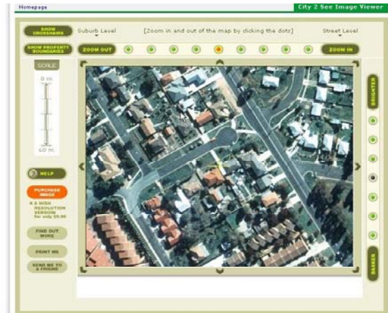
Sample: See your aerial photograph before you buy.